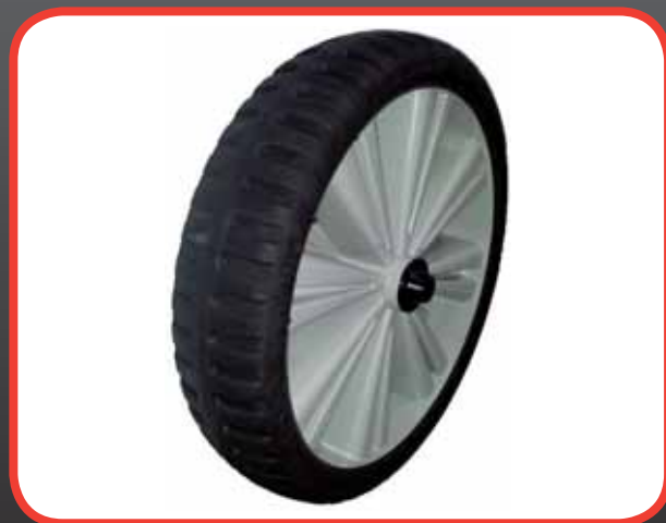
Flex Lite 'Puncture Proof' Wheel option is also available.